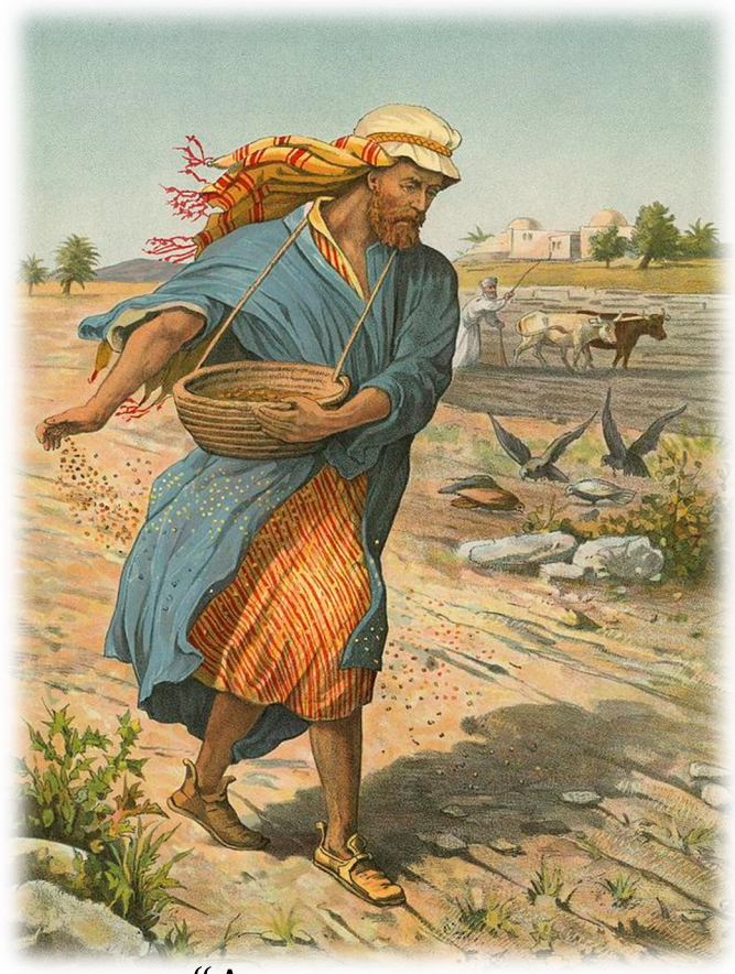
"A sower went out to sow." Matthew 13:1-23

Confessions Currently, By appointment Only