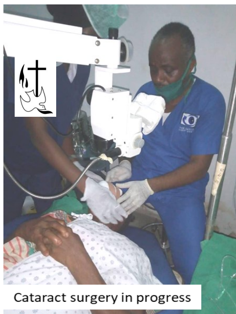
Cataract surgery in progress

Your support is vital for us to continue to provide free medical care to those who desperately need cataract and other surgeries. Through your donations, these patients who do not have the resources to afford operations can have the chance to regain their eyesight!