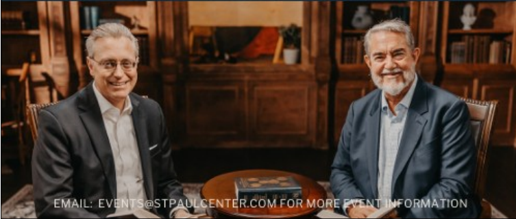
EMAIL: EVENTS@STPAULCENTER.COM FOR MORE EVENT INFORMATION